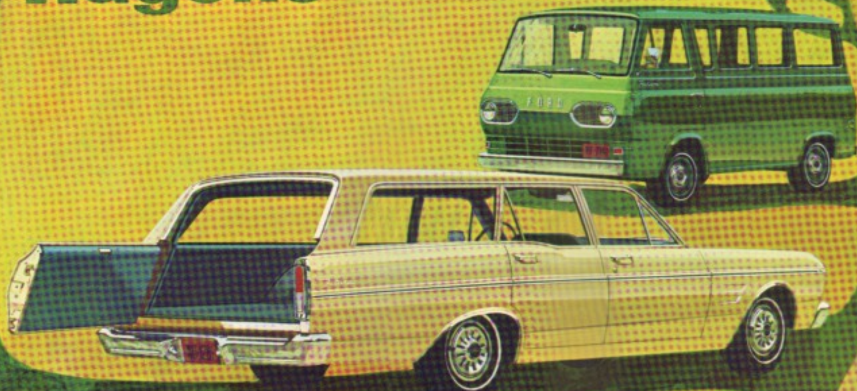
Falcon Futura Wagon