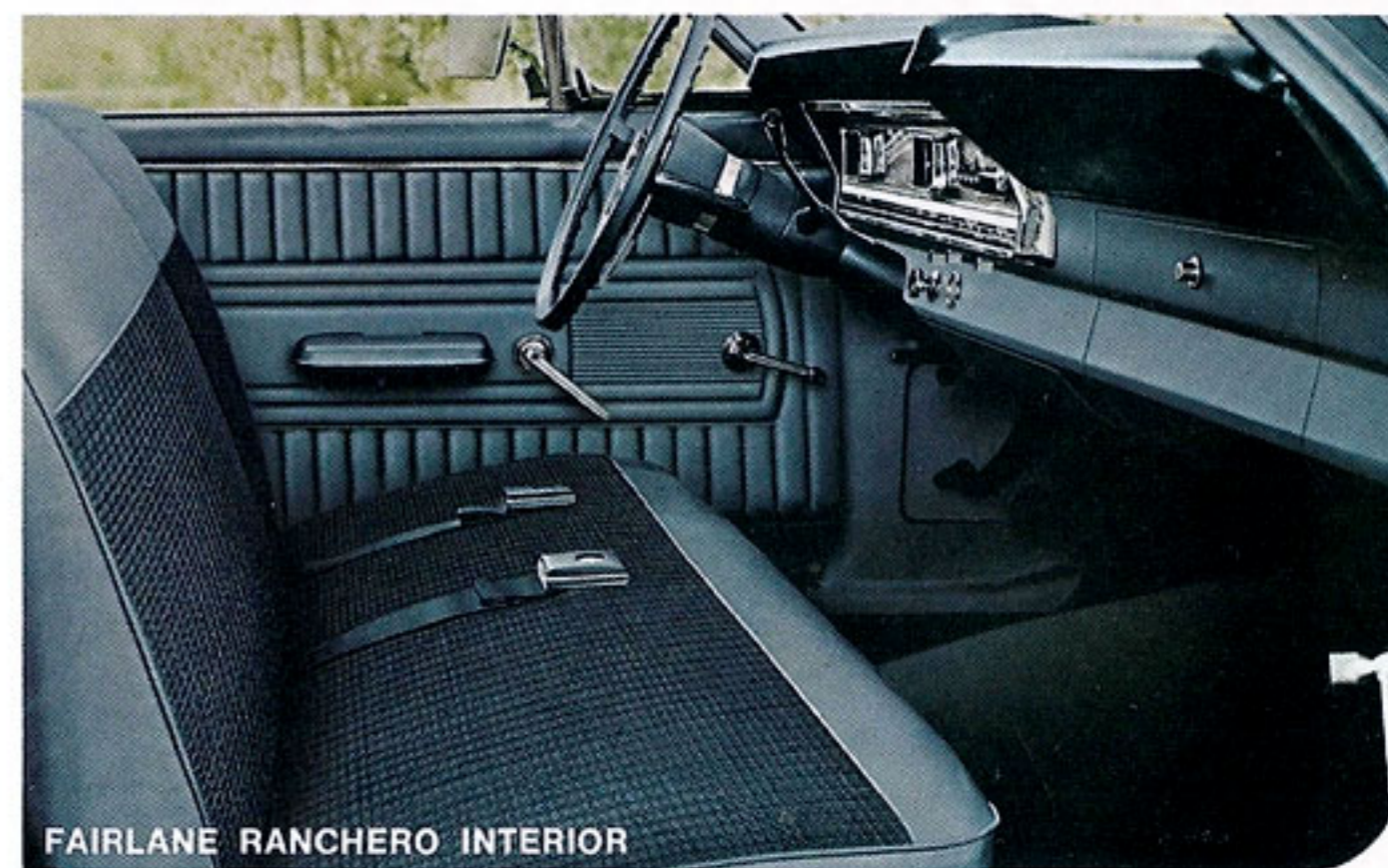
FAIRLANE RANCHERO INTERIOR