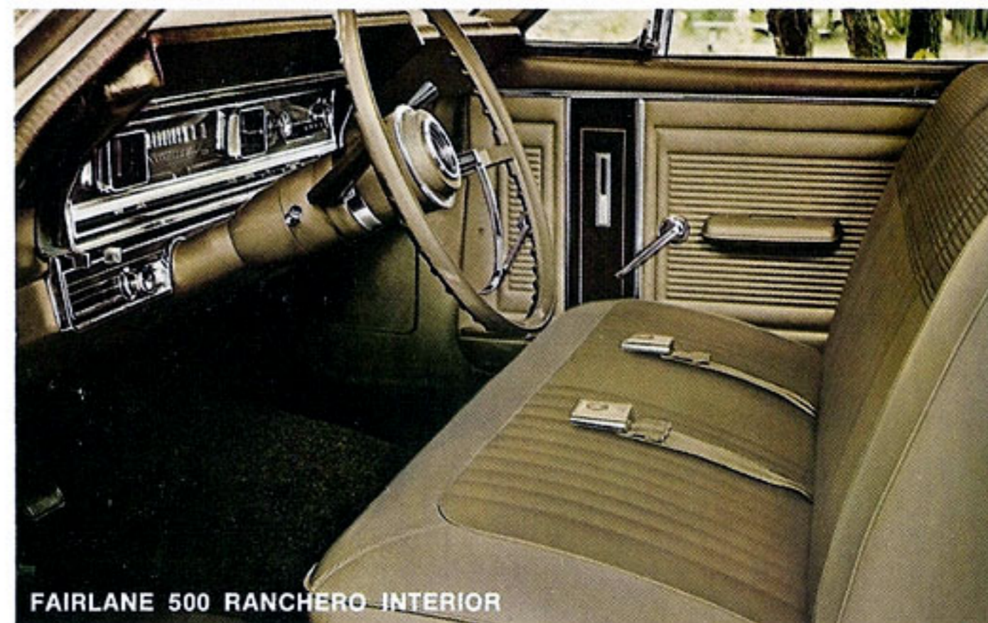
FAIRLANE 500 RANCHERO INTERIOR