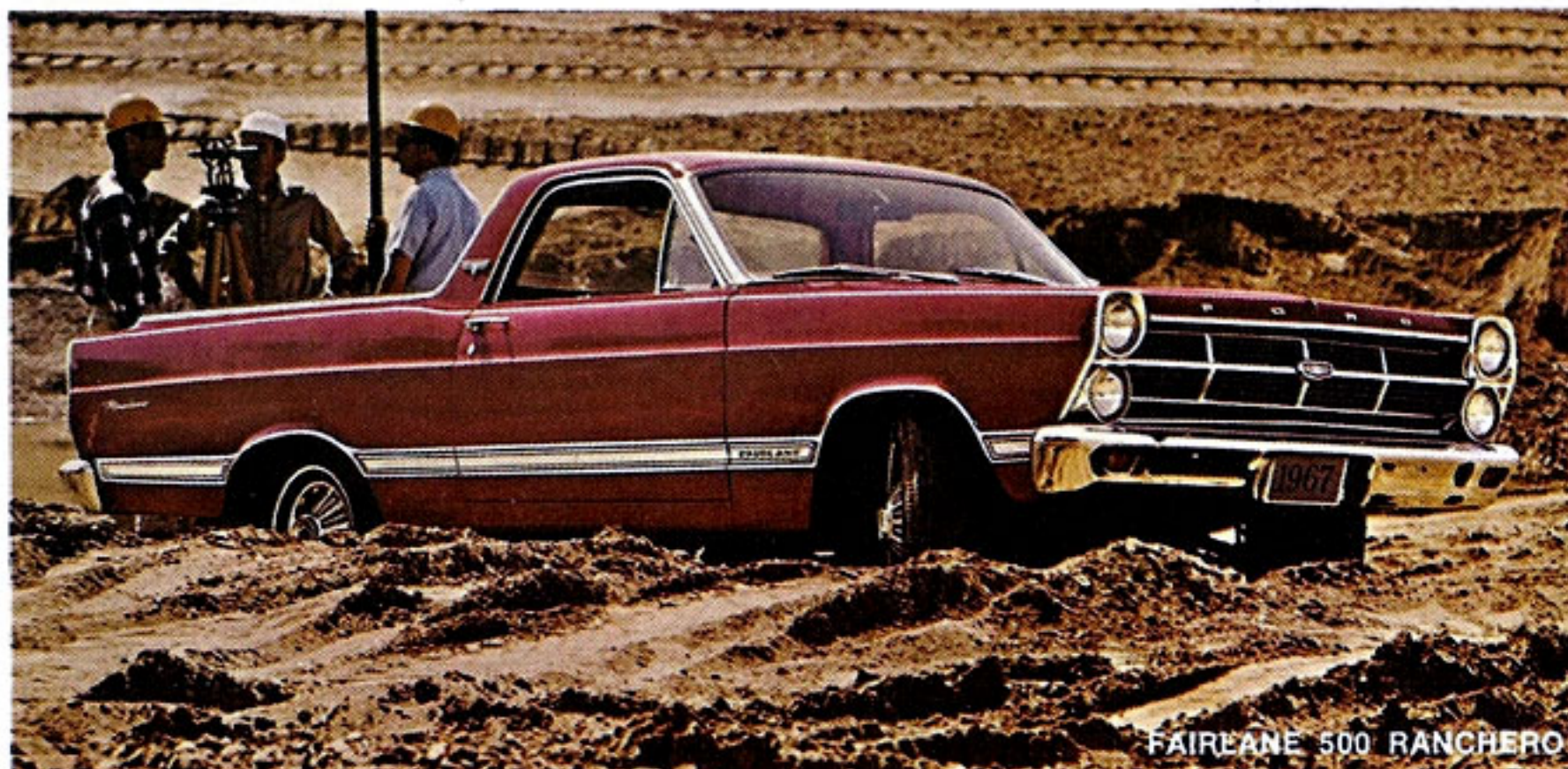
FAIRLANE 500 RANCHERO

EVERY 1967 FAIRLANE RANCHERO has been designed and quality-built to provide safer, more dependable service. Ford Motor Company Lifeguard-Design Fairlane Ranchero safety features are standard equipment in every 1967 Fairlane Ranchero. Safety depends upon the proper operation and maintenance of a vehicle . . . and use of the safety equipment provided.