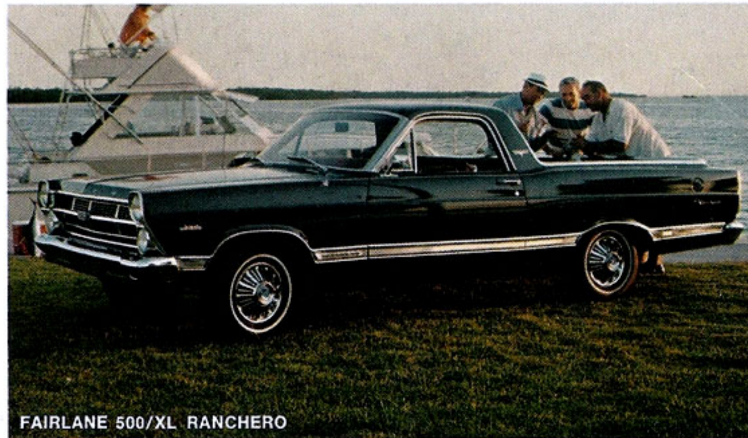
FAIRLANE 500/XL RANCHERO