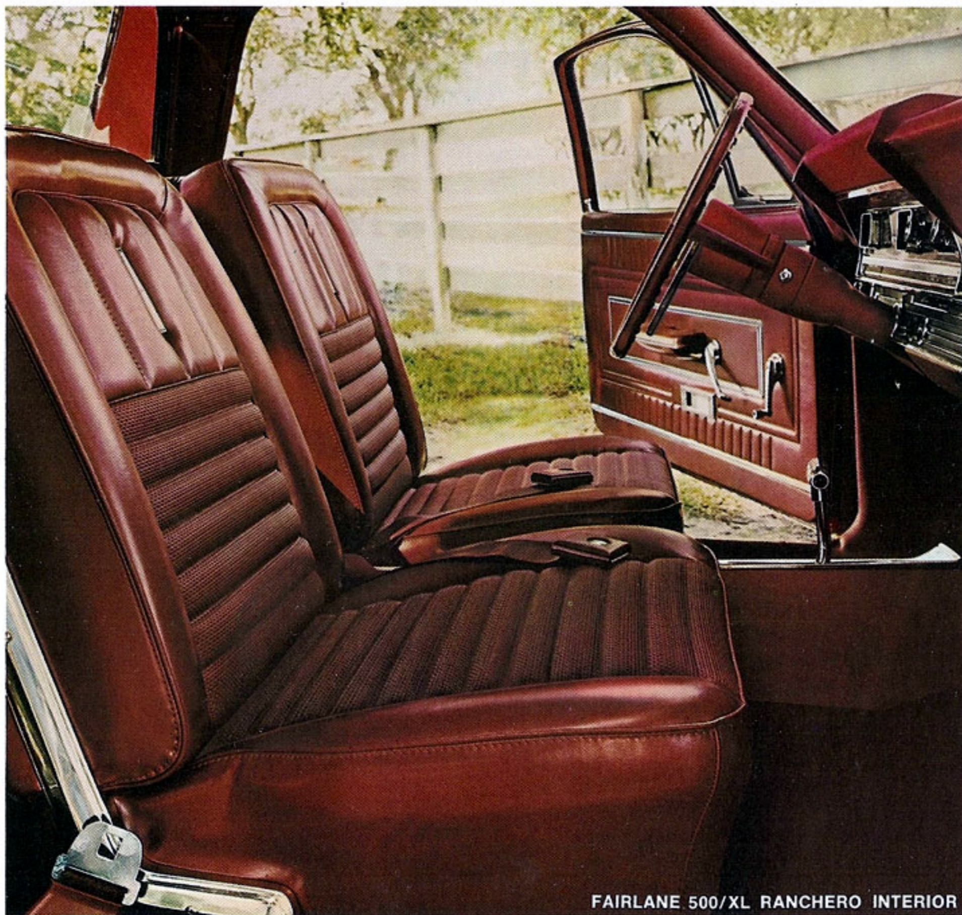
FAIRLANE 500/XL RANCHERO INTERIOR

FAIRLANE 500/XL RANCHERO . . . The XL is the ultimate in sport pickups. Standard equipment includes all the interior and exterior refinements of a Fairlane 500 plus bucket seats, center console and special trim items. The contoured bucket seats are full foam-cushioned for solid comfort, pleated for luxury, and upholstered with rosette-patterned vinyl trim in red, blue, parchment or black and color-keyed to 15 exterior colors. The center console accommodates a 3- or 4-speed manual shift lever or a new optional 3-speed SelectShift Cruise-O-Matic transmission for complete manual control or fully automatic shifting.