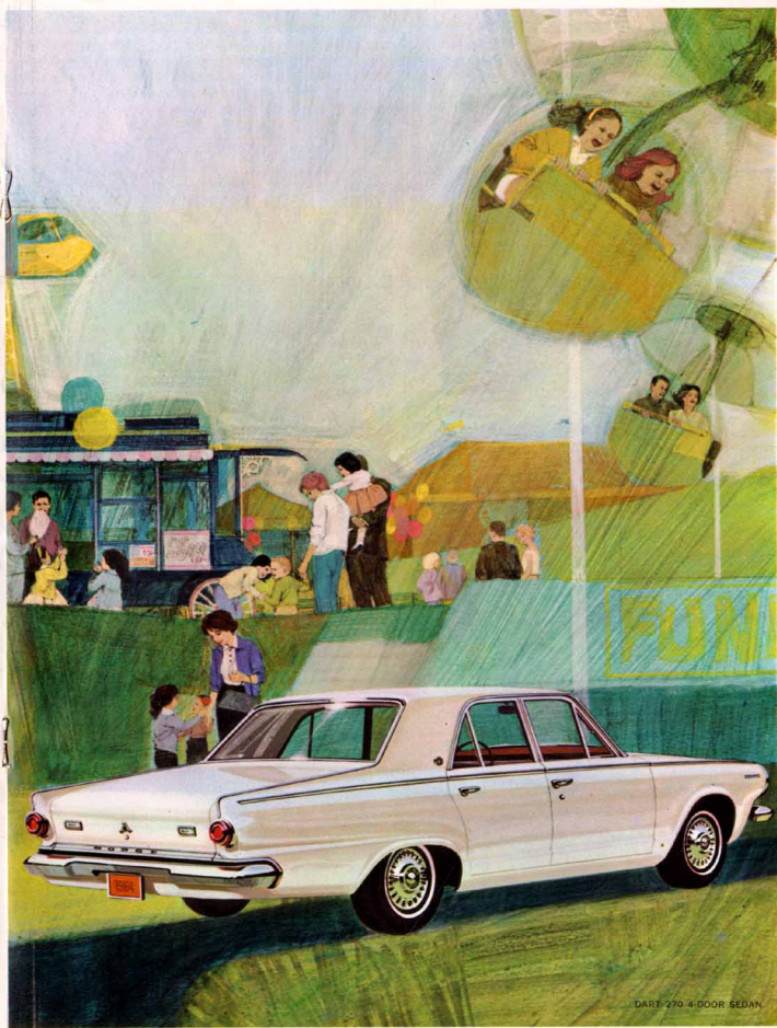
DART 270 4-DOOR SEDAN