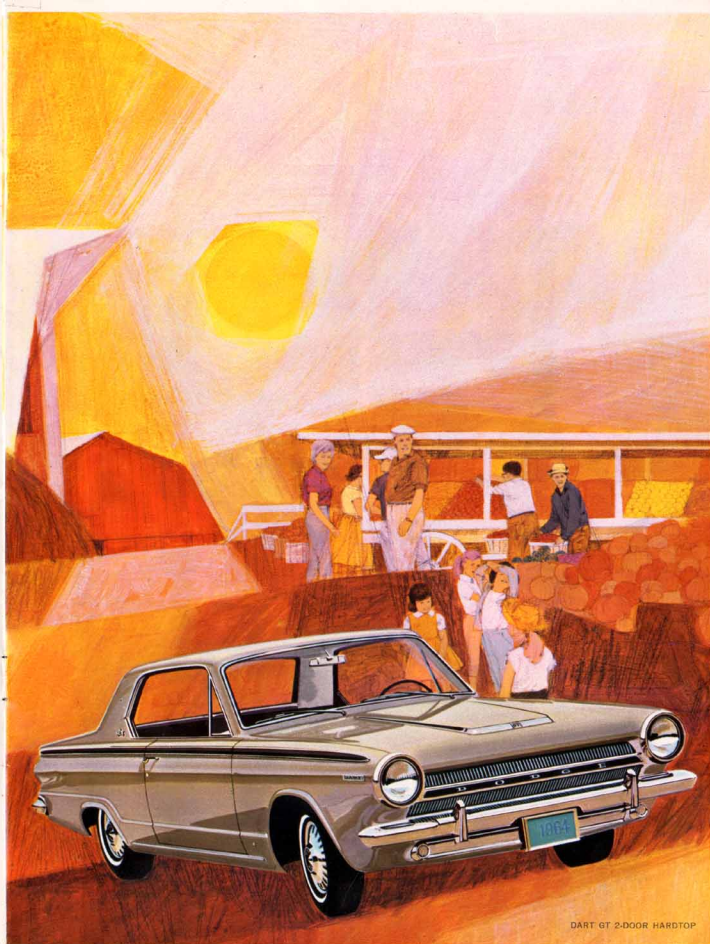
DART GT 2-DOOR HARDTOP