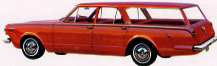
DART 170 4-DOOR STATION WAGON