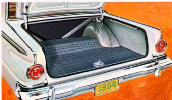
DART TRUNK HAS MORE USABLE SPACE THAN MANY FULL-SIZE CARS