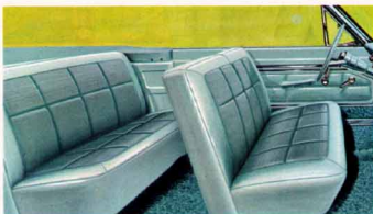
DART 270 WAGON AND CONVERTIBLE INTERIOR WITH ALL-VINYL TRIM

ENGINES: 170 SLANT SIX (standard), 225 SLANT SIX (optional)