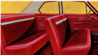
DART 170 2-DOOR SEDAN INTERIOR WITH NYLON AND VINYL TRIM

ENGINES: 170 SLANT SIX (standard), 225 SLANT SIX (optional)