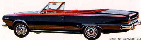
DART GT CONVERTIBLE