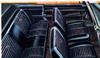
DART GT INTERIOR WITH BUCKET SEATS AND ALL-VINYL TRIM

ENGINES: 170 SLANT SIX (standard), 225 SLANT SIX (optional)