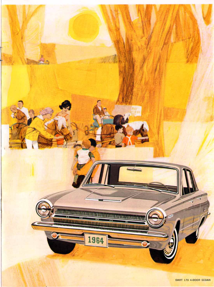
DART 170 4-DOOR SEDAN