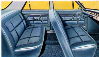
DART 270 SEDAN INTERIOR WITH NYLON AND VINYL TRIM