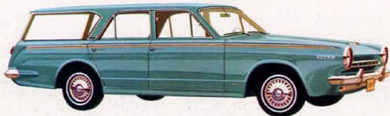
DART 270 4-DOOR STATION WAGON