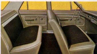
DART 170 4-DOOR SEDAN INTERIOR WITH NYLON AND VINYL TRIM