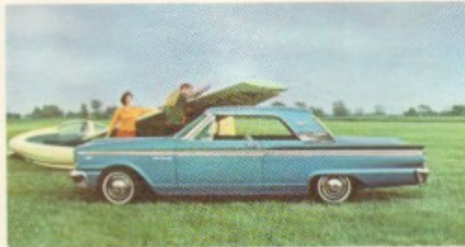
Ford Fairlane 500 2-Door Hardtop