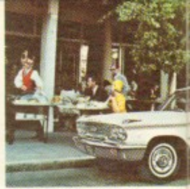
Ford Galaxie 2-Door Sedan