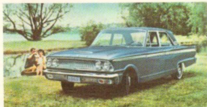
Ford Fairlane 500 4-Door Sedan

... the newest size Ford now offers a full line of models to choose from, including hardtops and wagons.