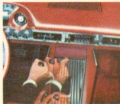
Among the sporty features available to Galaxie owners is this optional 4-speed floor shift.