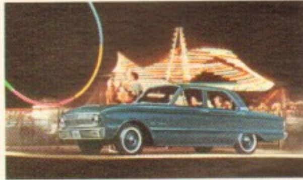
Falcon 4-Door Sedan