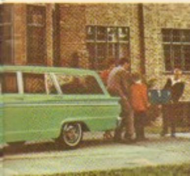
Ford Galaxie Country Squire