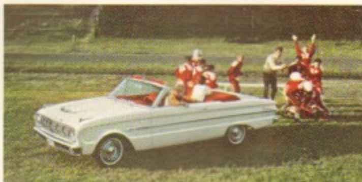
Falcon Futura Sports Convertible

...led by a brand-new convertible offer a new look in compacts... and a new compact convenience—Twice-a-Year Maintenance.