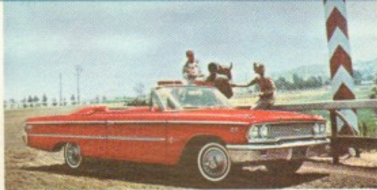
Ford Galaxie 500/XL Convertible