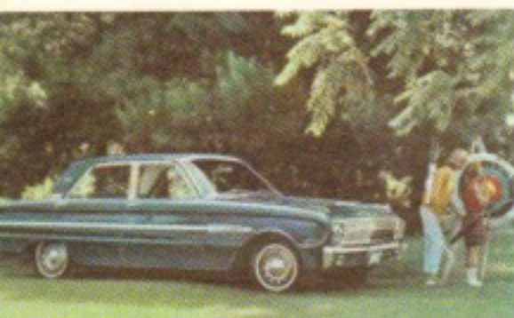
Falcon Futura 4-Door Sedan