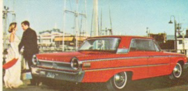
Ford Galaxie 500 2-Door Hardtop