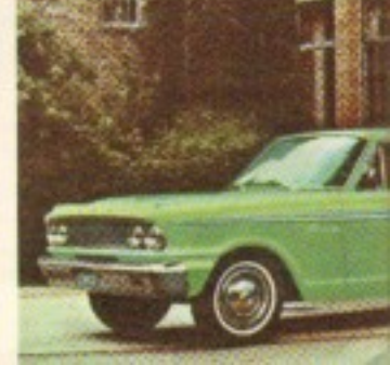
Ford Fairlane Custom Ranch Wagon

... from Ford, America's station wagon specialist, prove "you can take it with you" ... and travel in style.