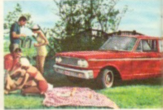
Ford Fairlane 2-Door Sedan