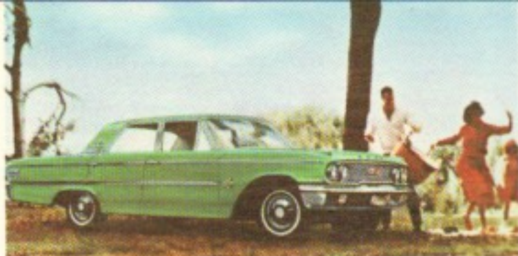
Ford Galaxie 500 4-Door Sedan

... bring you the look, the power and the feel of Thunderbird, including an optional Swing-Away steering wheel.