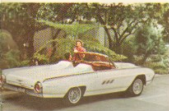
Thunderbird Sports Roadster