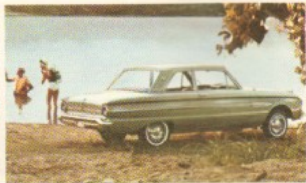
Falcon Futura 2-Door Sports Sedan