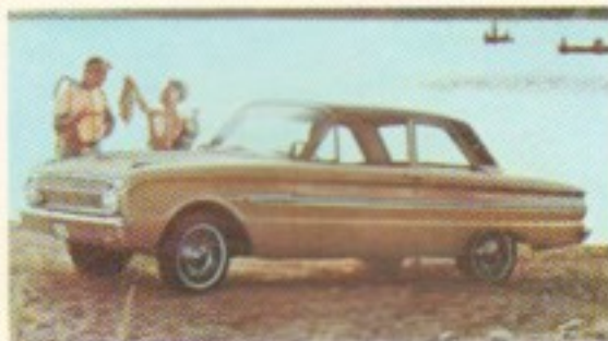
The Falcon Futura 2-Door Sports Sedan. Standard features include form-fitting, foam-padded bucket seats, personal console, wall-to-wall carpeting, elegant upholstery. Falcon Futura's roofline has that Thunderbird look—and it's available with a handsome vinyl covering.

If you're a driver who wants to live it up at low cost, Falcon is your car—and '63 is your year. On top of all its proven economy advantages—low price, high gas mileage, remarkable durability—Falcon* now has all of Ford's easy-maintenance features! ■ Hop into a frisky, fun-loving Falcon and save! Falcons now go 36,000 miles between major chassis lubes . . . 6,000 miles between oil changes and minor lubes . . . and have self-adjusting brakes. All told, you'll need routine servicing just twice a year or every 6,000 miles—which leaves you lots more time for the fun of driving. ■ And if you want to have fun by raising the roof—go to it with a brand-new Falcon convertible. These low-slung, high-spirited Falcons look sharp standing still—and even sharper when streaking along a highway. Power-operated top is standard equipment. ■ The Falcon Six engine is famous for squeezing extra mileage out of every gallon of gas. For added zip, choose the optional 170 Special. ■ All told, there are 15 Falcons—including 8 peppy and practical wagons. And no matter which you choose you're getting the . . .