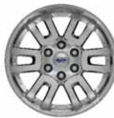
18" Machined Aluminum Standard