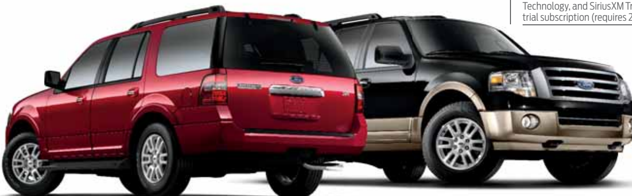
XLT. Ruby Red Metallic Tinted Clearcoat. XLT Premium EL. Tuxedo Black Metallic. Available equipment.