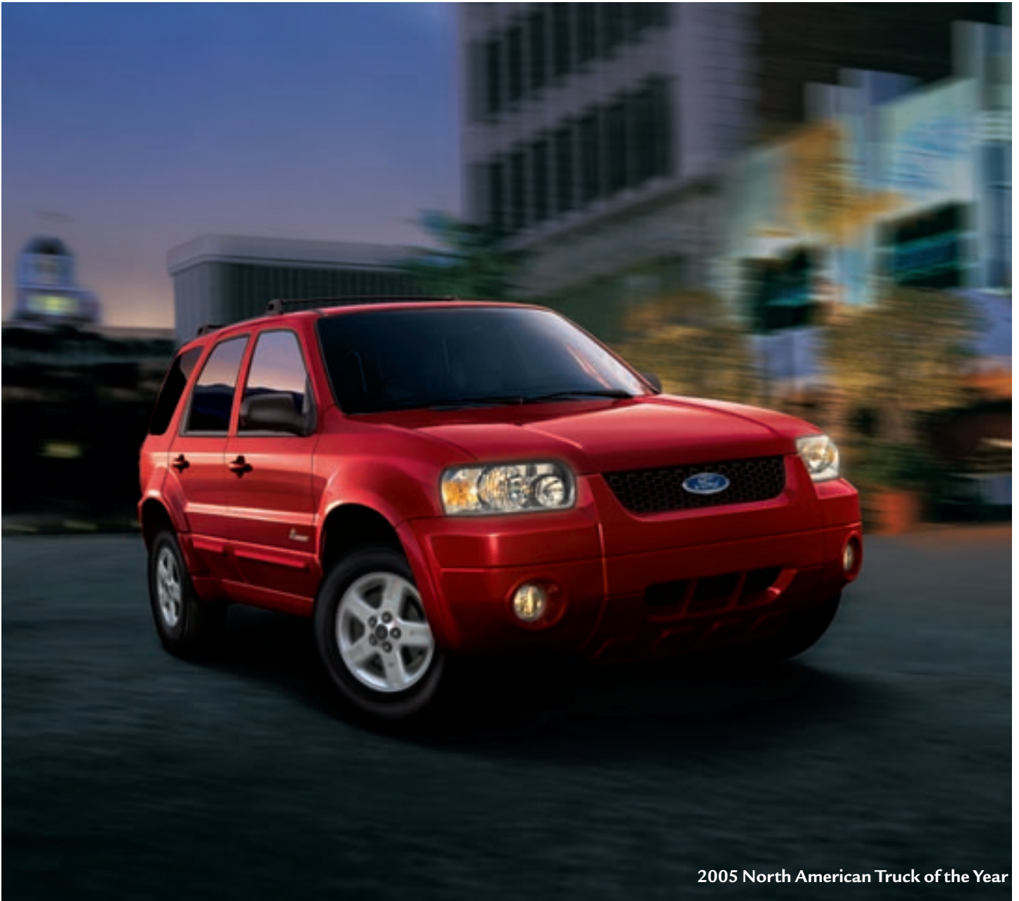
2005 North American Truck of the Year