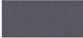
Dark Shadow Grey Metallic