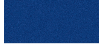
Sonic Blue Metallic