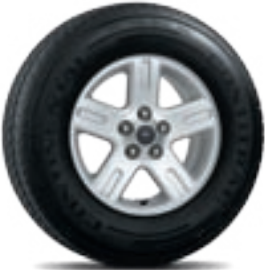
16" Aluminum Wheel Standard