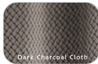
Dark Charcoal Cloth

Or choose from some great "no-starch-thank-you" cloth seating options.