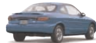
Bright Atlantic Blue