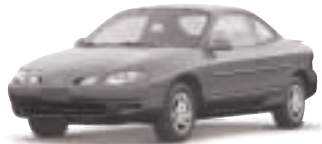
Dark Shadow Grey

ZX2 can pull off any color that you throw on it. Not every car can say that. Hey, when you're zippy, fun and wild ... you can look zippy, fun and wild.