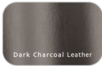
Dark Charcoal Leather

ZX2 definitely isn't the stuffed-shirt type. Its sporty, go-anywhere leather-trimmed seating selections are up for anything.