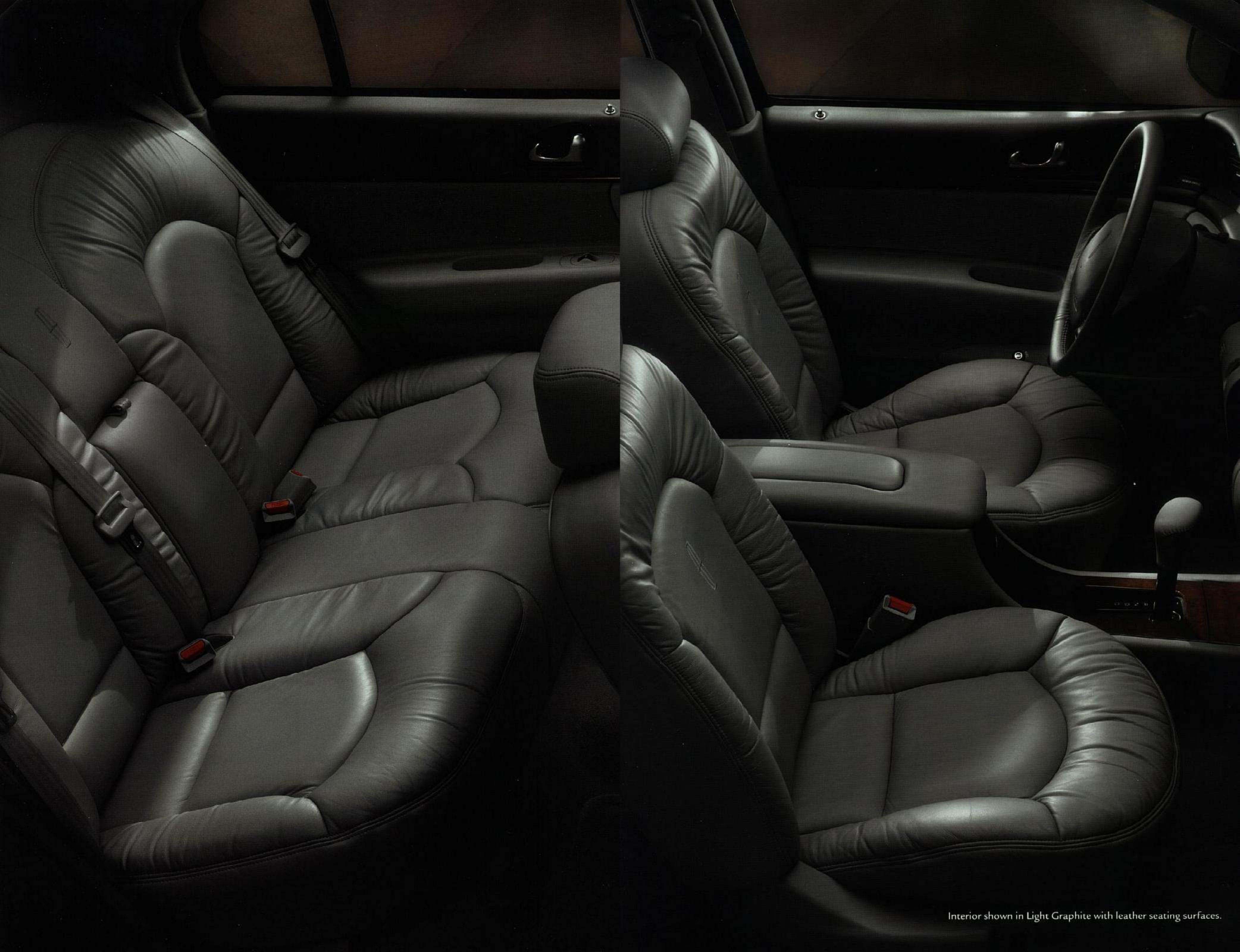
Interior shown in Light Graphite with leather seating surfaces.