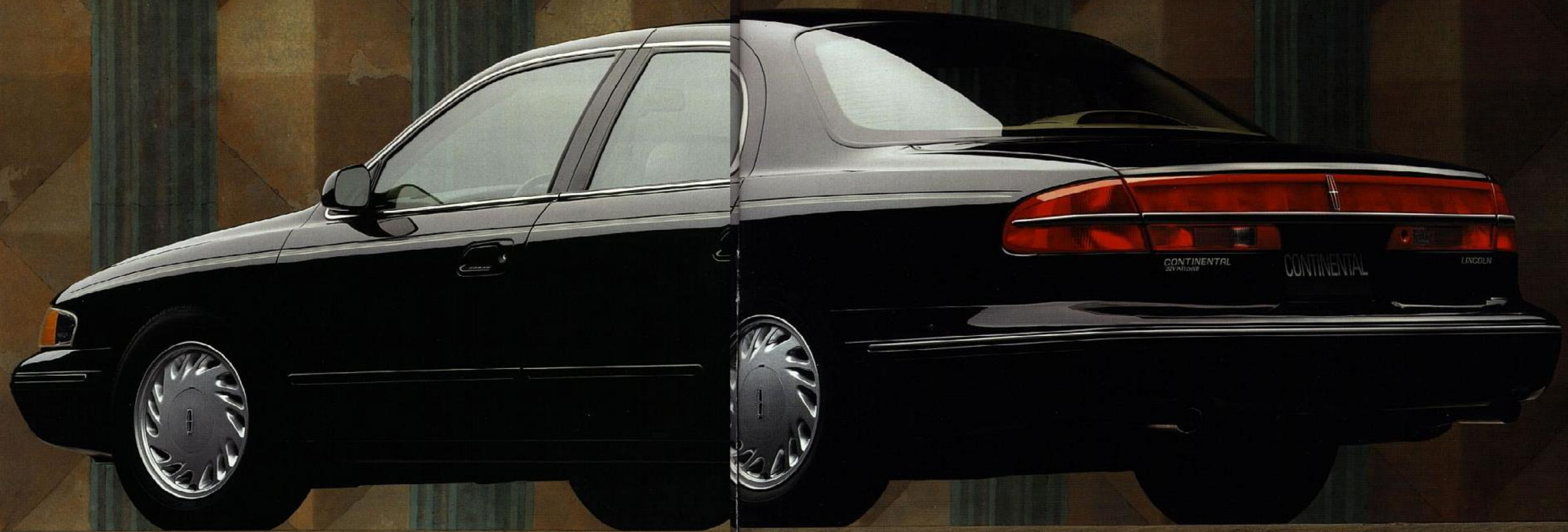
Continental shown in Black Clearcoat.