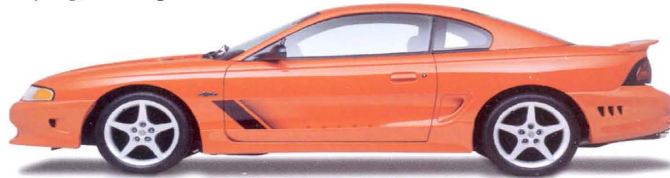
S281 Coupe, shown in Bright Tangerine Clearcoat.

The new Saleen S281 Mustang is designed to fulfill every expectation of discerning motorists who understand and appreciate what a true high performance automobile should be.