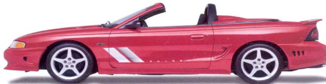
S281 Speedster, shown in Rio Red Tinted Clearcoat.