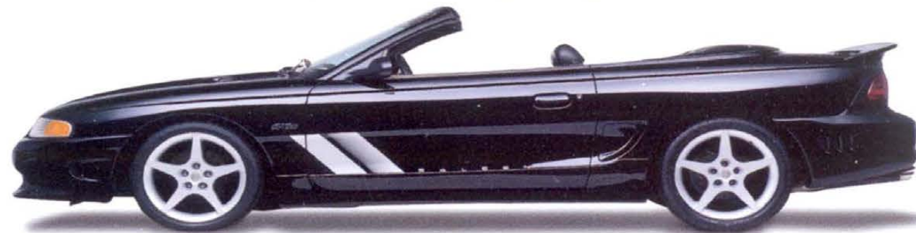
S281 Convertible, shown in Black Clearcoat.