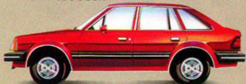
LYNX LS 5-DOOR