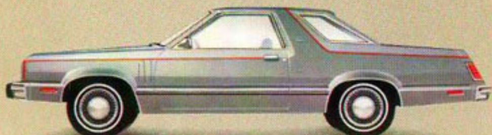
ZEPHYR Z-7 SPORT COUPE