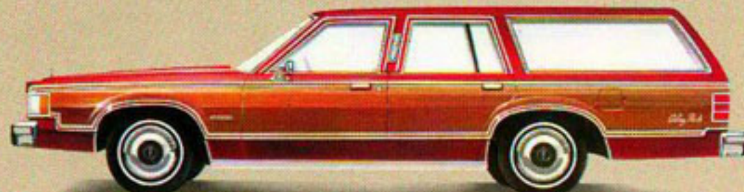
GRAND MARQUIS COLONY PARK WAGON