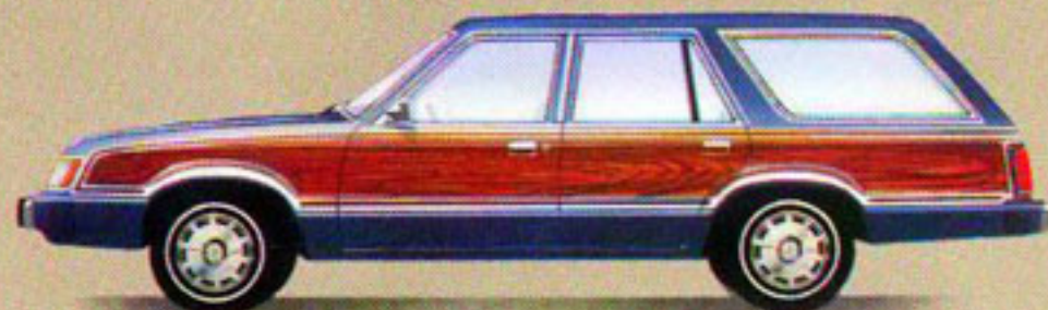
MARQUIS WAGON WITH BROUGHAM DECOR OPTION