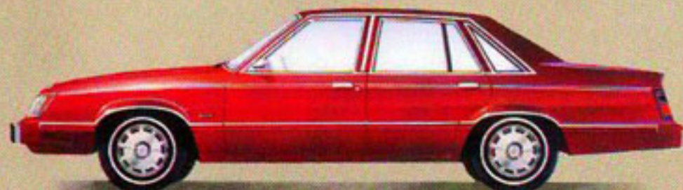
MARQUIS BROUGHAM 4-DOOR SEDAN