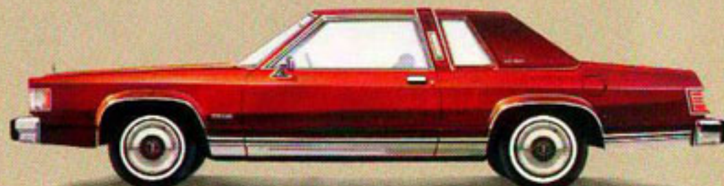
GRAND MARQUIS 2-DOOR SEDAN