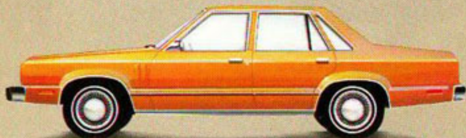
ZEPHYR 4-DOOR SEDAN