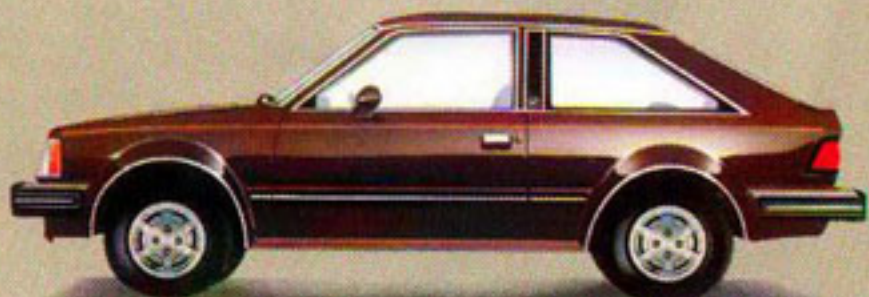
LYNX LS 3-DOOR