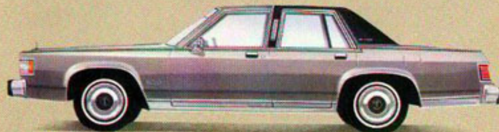
GRAND MARQUIS 4-DOOR SEDAN