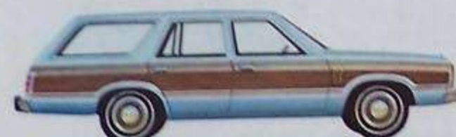
Zephyr Station Wagon w/Villager Option