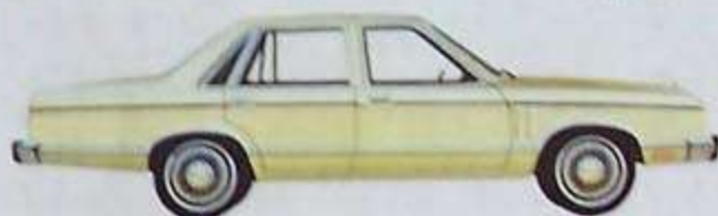
Zephyr 4-dr. w/Ghia Option