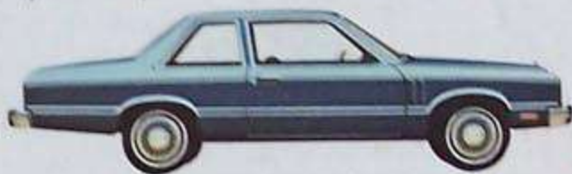
Zephyr 2-dr. w/Ghia Option