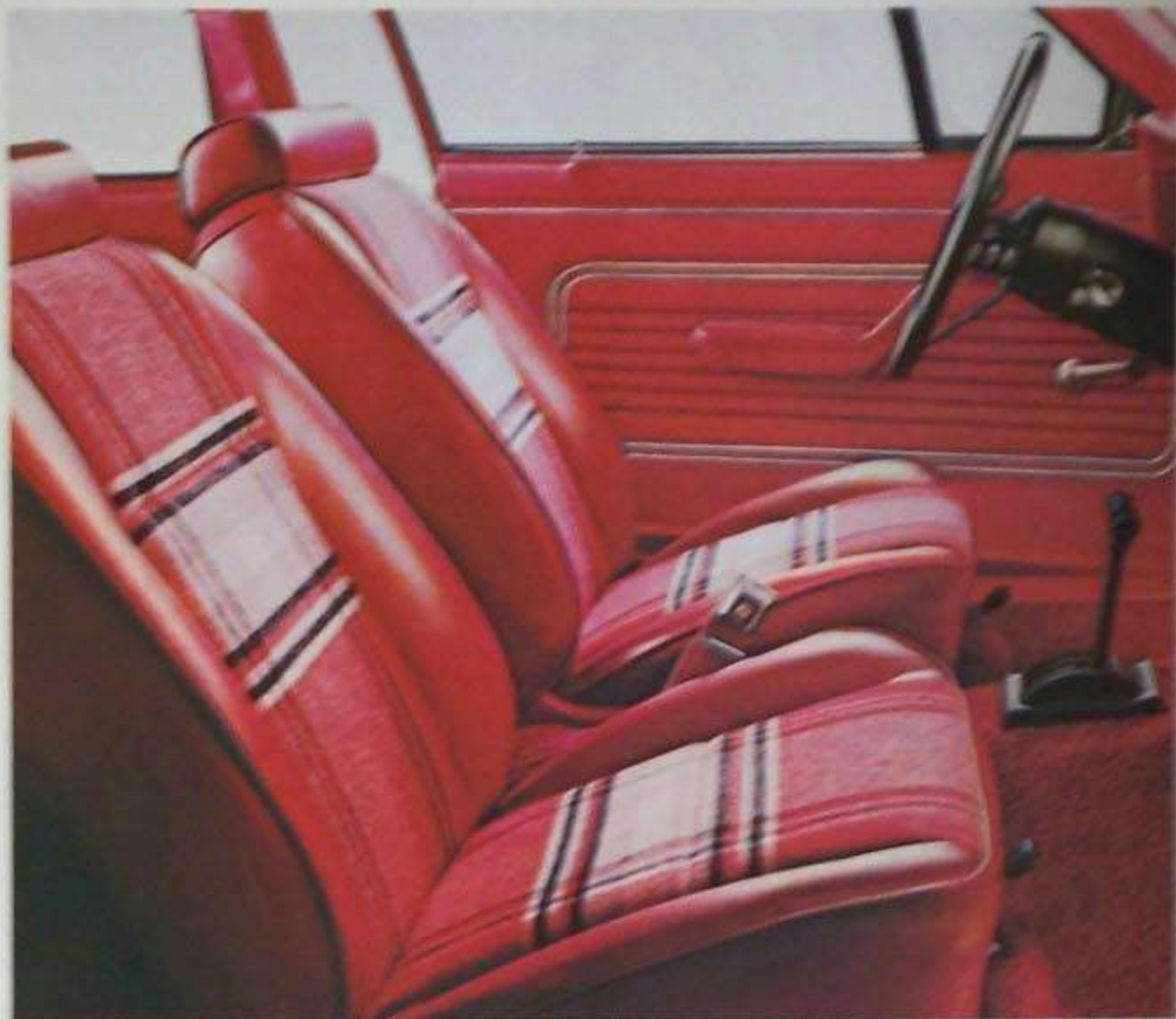
Interior Accent Group Option with optional Brodie Cloth seat upholstery

an extra burst of power, but only when you need it.