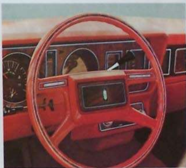
Optional 4-spoke Luxury Steering Wheel