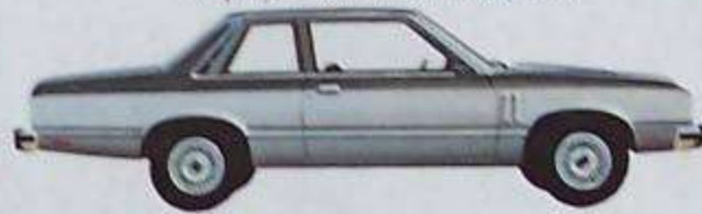
Zephyr 2-dr. w/2.3L Turbocharged Engine