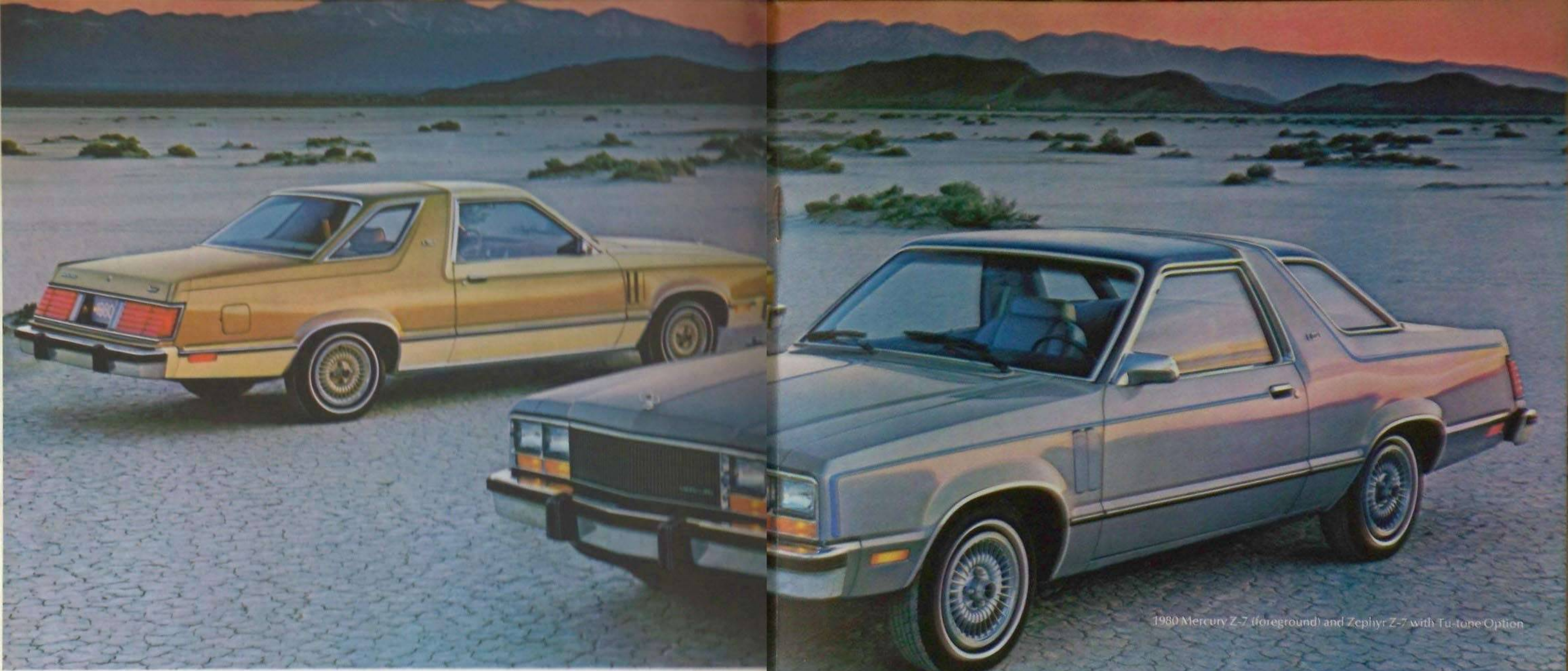
1980 Mercury Z-7 (foreground) and Zephyr Z-7 with Tu-tone Option