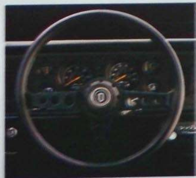
Sports Instrumentation Group Option

Every Zephyr is created to be fun to drive. And if you want to pack an added punch of pleasure in your driving, give serious thought to the Zephyr with turbocharged engine, shown at the top of the facing page. Zephyr equipped with a 2.3-liter Turbo engine gives you