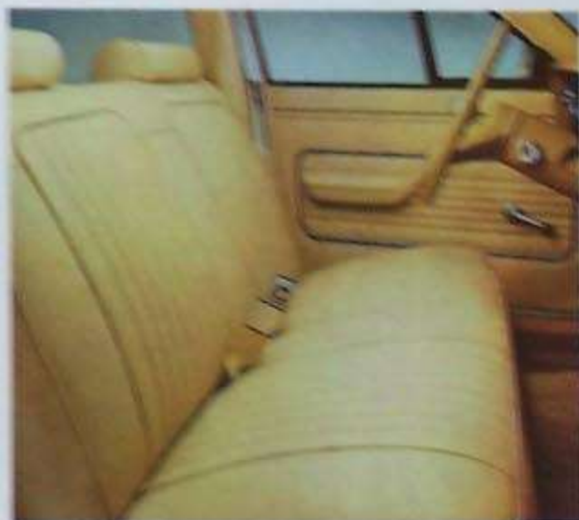
Optional Bench seat (Standard with optional engine)