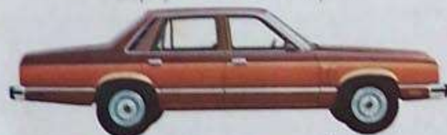
Zephyr 4-dr. w/Tu-tone Option