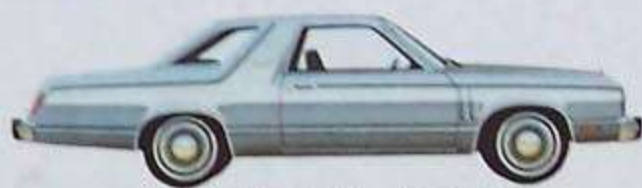
Zephyr Z-7 Sports Coupe

*Exhaust system components or parts which develop corrosion perforation caused by accidents or other damage are not covered.