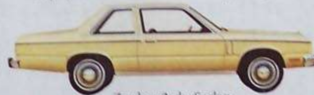
Zephyr 2-dr. Sedan