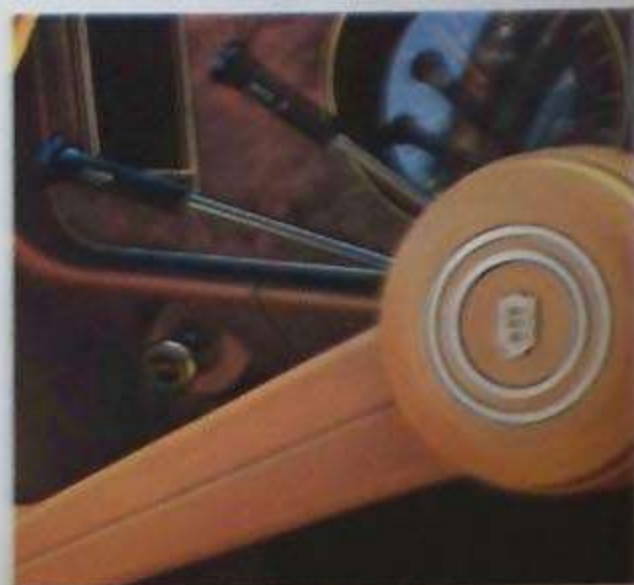
Standard stalk-mounted controls

NOTE: Some items are optional. See notable standard features, measurements, and color code reference listed throughout this catalog.