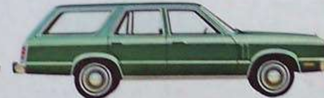
Zephyr Station Wagon