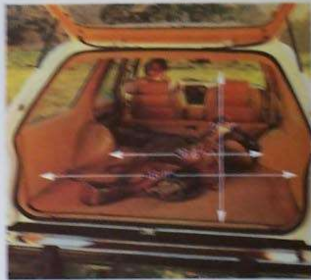
Zephyr Wagon dimensions