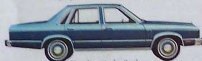
Zephyr 4-dr. Sedan