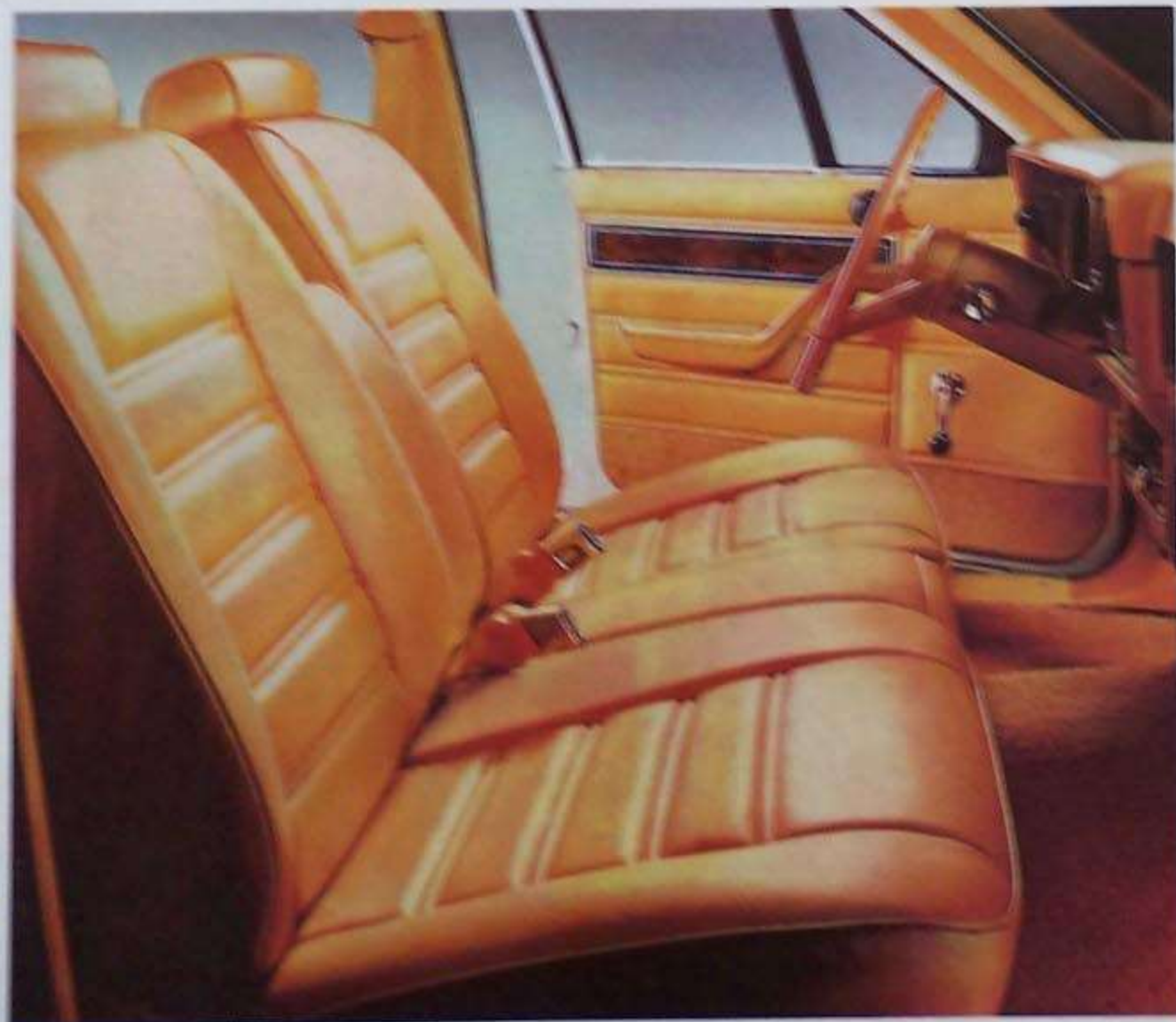
Zephyr Wagon with Chia Interior Option (High Bench seat)

NOTE: Some items are optional. See notable standard features, measurements and color code references listed throughout this catalog.