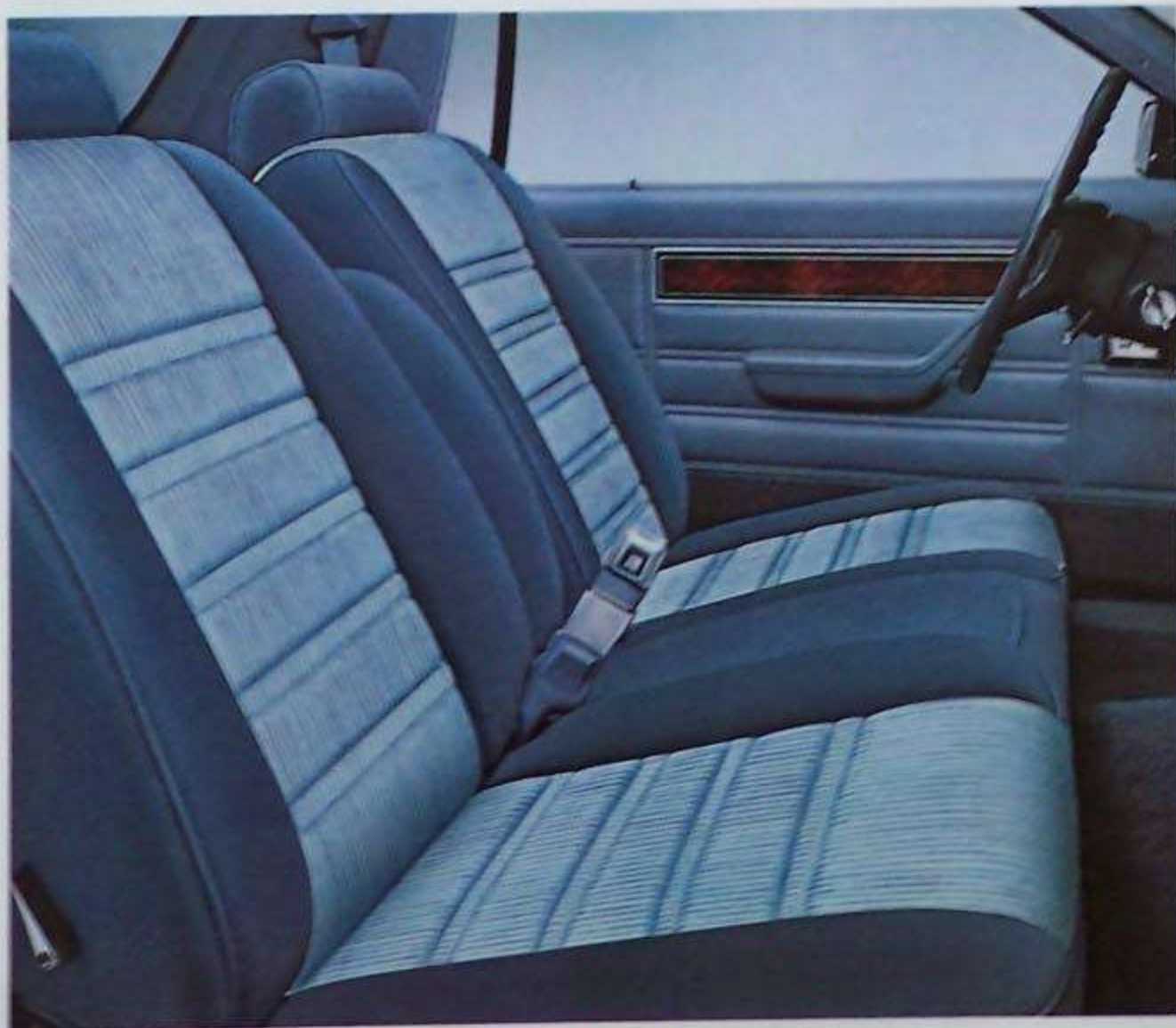
Zephyr w/Ghia Flight Bench seat trim

Mercury Zephyr with Ghia Option is available either in two-door or, as pictured on the opposite page, four-door. Both offer plush touches and roomy comfort for five. For an X-ray view of Zephyr's interior spaciousness and spacious luggage compartment, check the picture upper right.